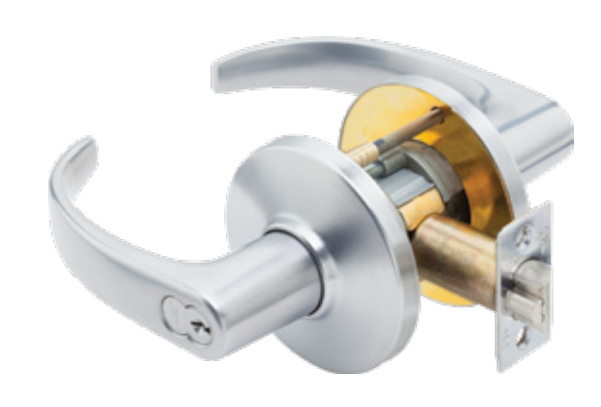
BEST 9K Series Heavy Duty Cylindrical Locks