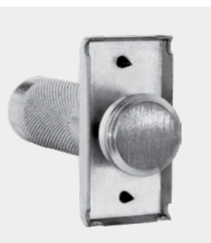
KD315 (Fed. Spec. 161)